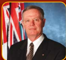
ADML (Ret'd) Chris Barrie, Former Chief of the Australian Defence Force